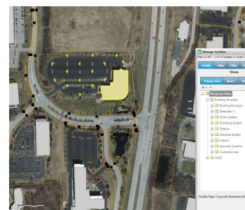
Facilities and Property Management