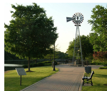
Enterprise Asset Management Software Implementation