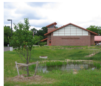
Joint Fire Station Parking Lot, Campus Drive, Site, and Utilities