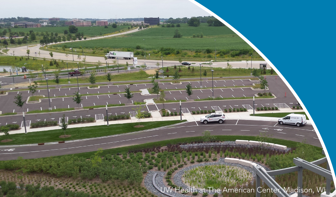
UW Health at The American Center, Madison, WI

Economic development is an advanced collaboration between the public and private sectors within cities, villages, and towns. Traditionally, a municipality's goals are to continue new job growth, increase property tax revenue, and maintain an enjoyable and charming community. Similarly, businesses are focused on increasing profits and growth opportunities.